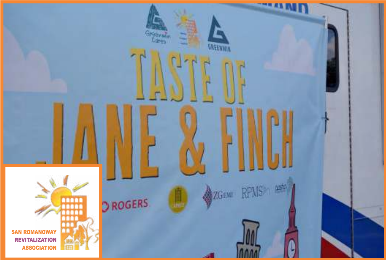
Plenty of food, fun and activities at the inaugural Taste and Sounds of Jane and Finch.