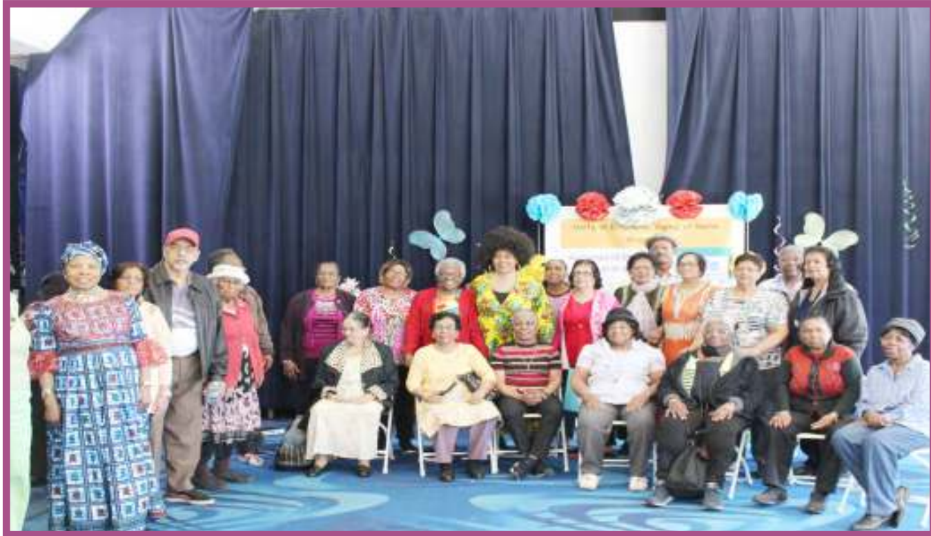
Senior's "Sunshine Group".