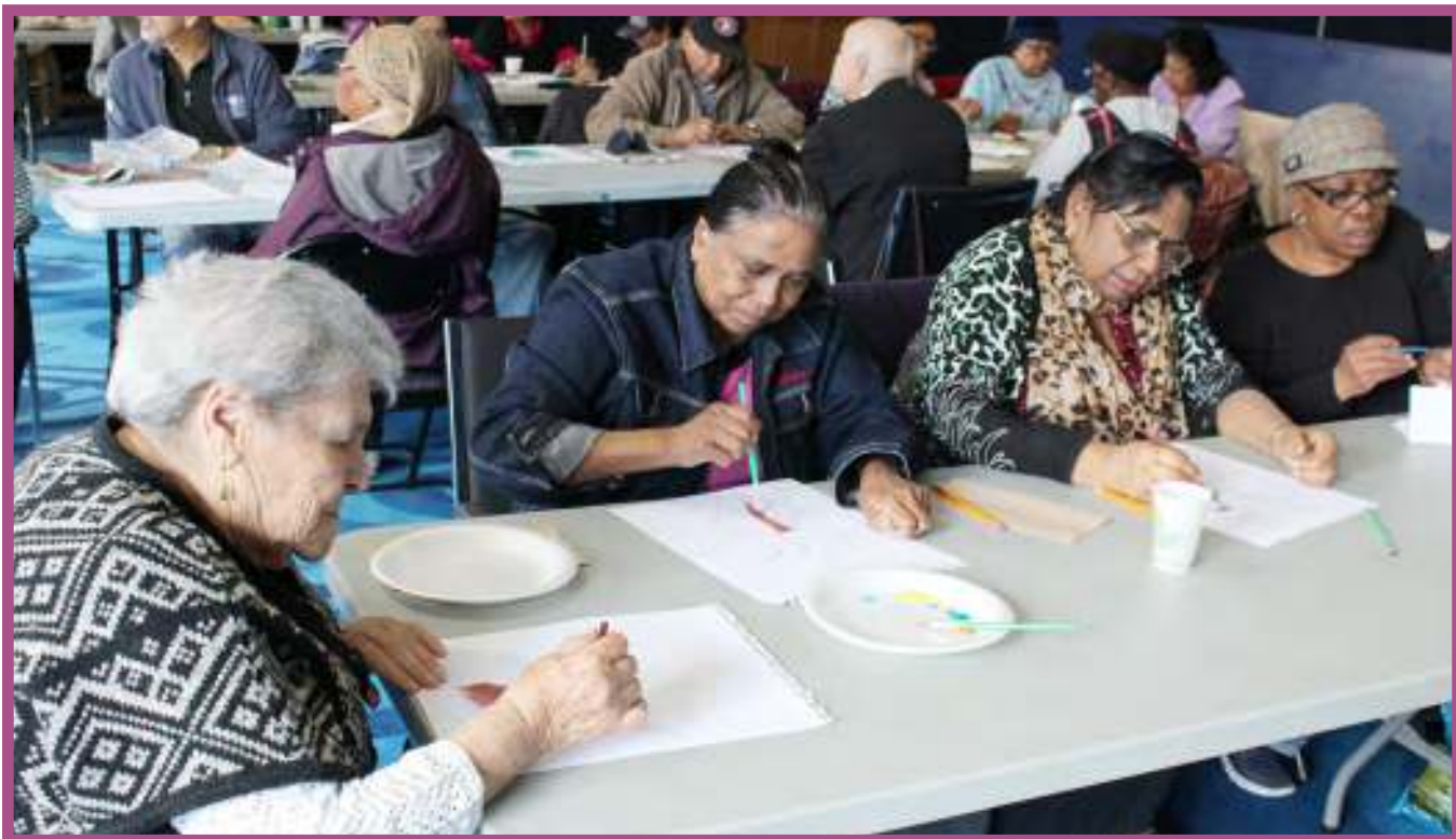
Our seniors expressing themselves through art.