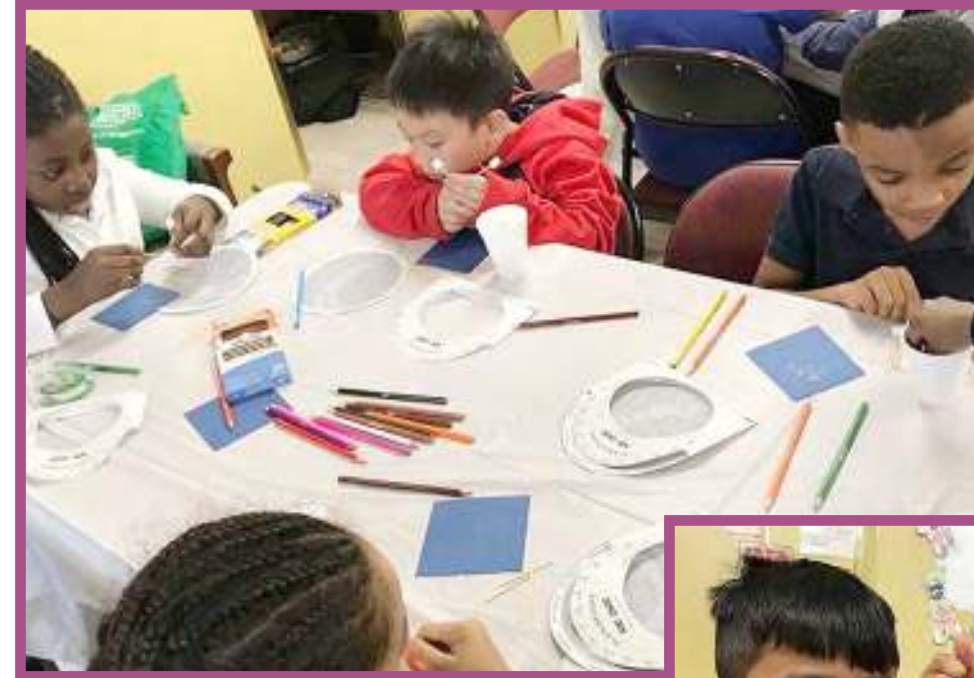
Breakfast and After-School Program – showing great teamwork.

Our partnership with Let's Talk Science has opened the minds of our students through numerous science experiments and activities.