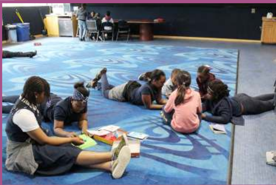
Boys and Girls Club – spending time reading, or engaging in team building activities.