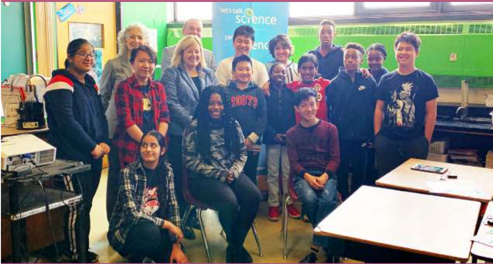
Honourable Lisa Thompson – Minister of Education visited our Humber Summit MS After School Program with Let's Talk Science.