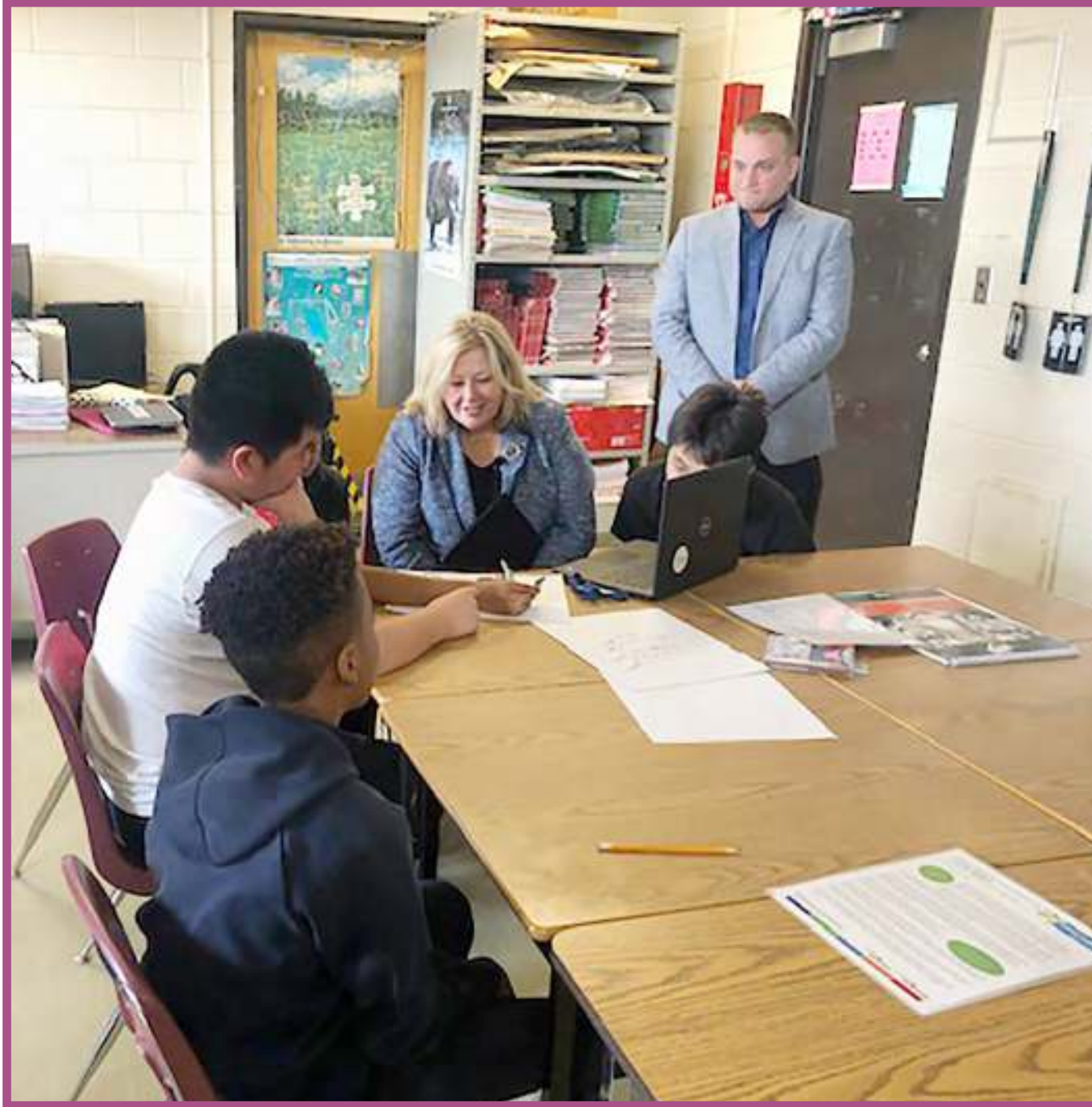
Honourable Lisa Thompson – Minister of Education learns the fundamentals of coding with Humber Summit MS After School Program and Let's Talk Science.